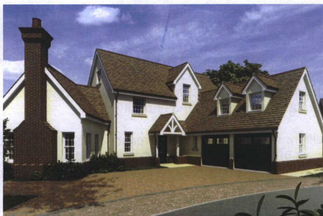
The proposed housing will be of a similar style and quality to these Bellway Homes in Billericay