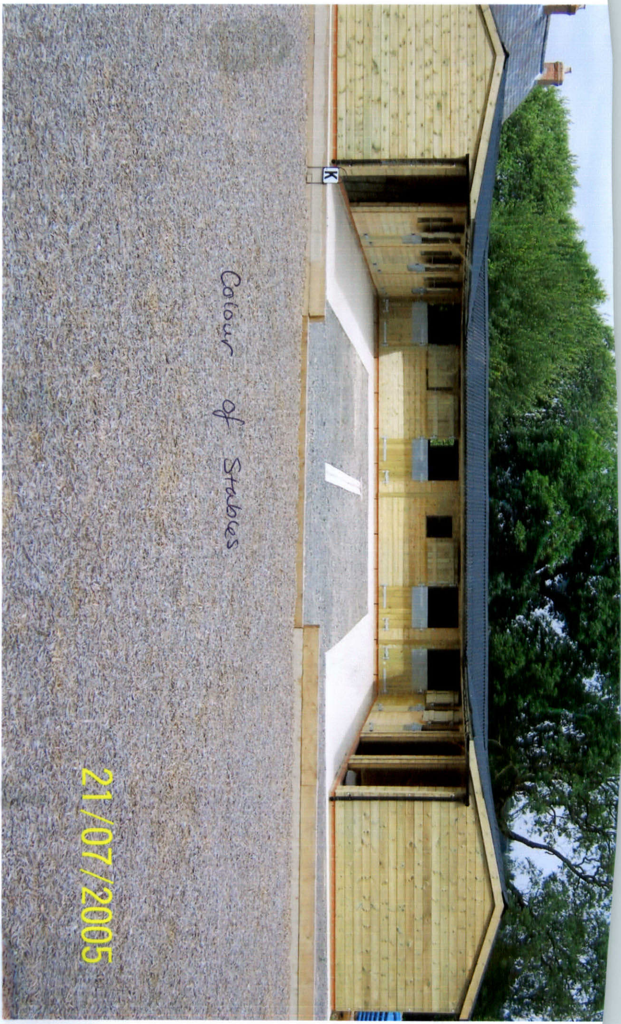
Colour of Stables