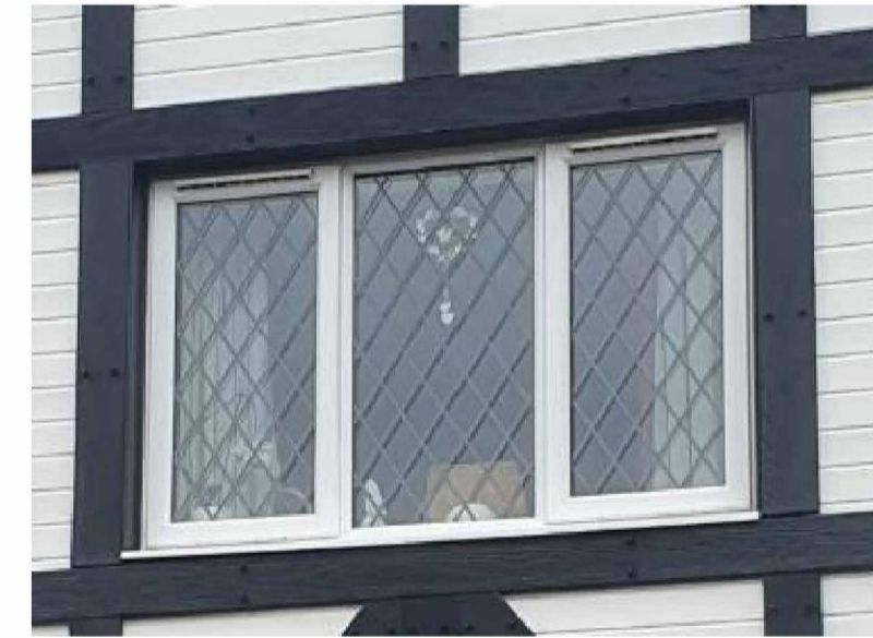
5 - BLACK TIMBER DETAILING AROUND WINDOWS.