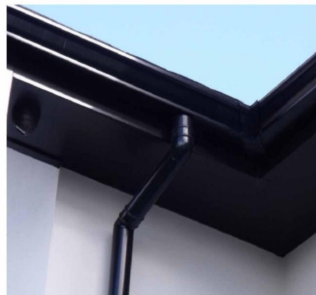
6 - BLACK UPVC GUTTERING AND DOWNPIPES.