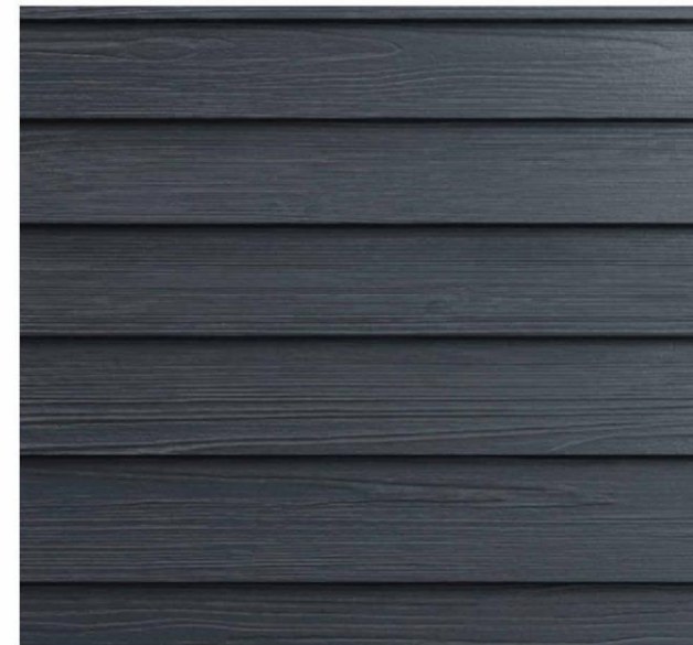
3 - BLACK HARDIE PLANK CLADDING