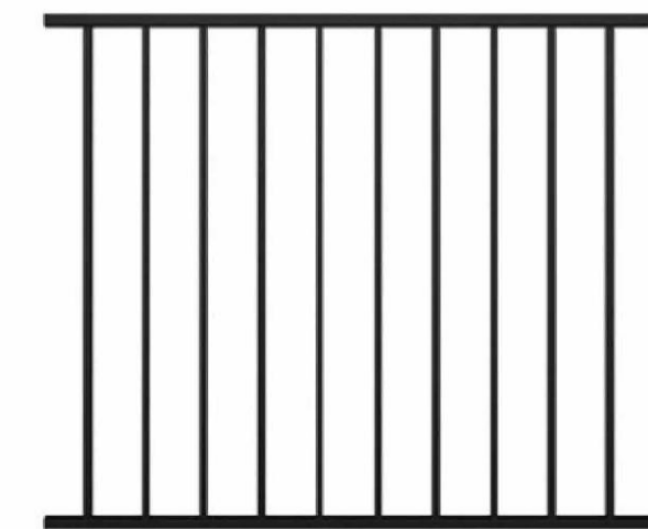
9 - CAST IRON BALUSTRADE.