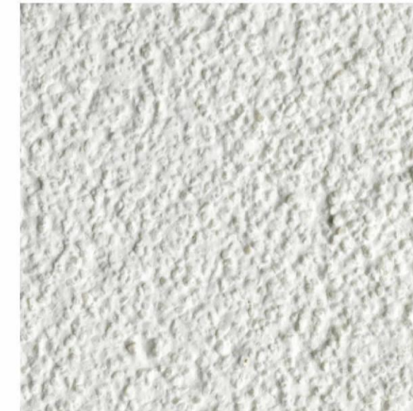
8 - WHITE SILICONE RENDER - BRAND K REND.