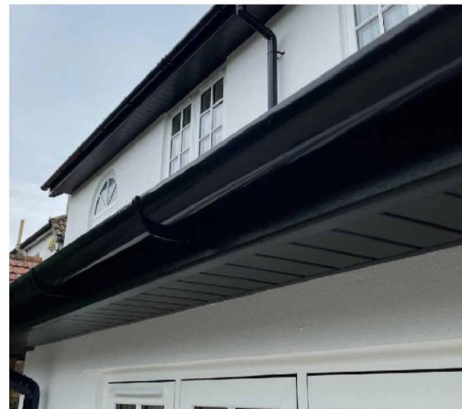
2 - BLACK UPVC FASCIA BOARD AND SOFFITS