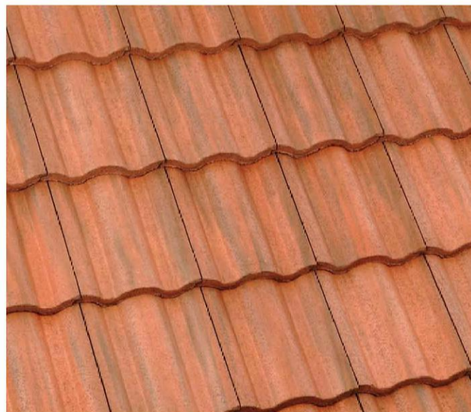
1 - ORANGE CLAY ROOF TILES