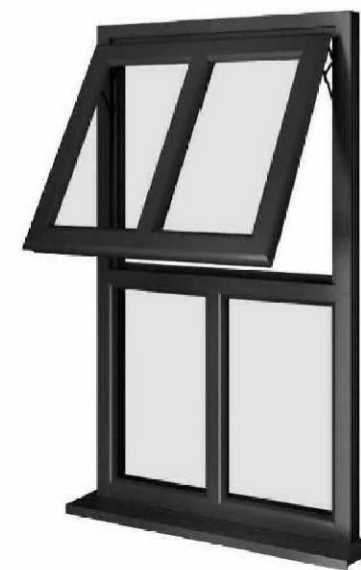
7 - BLACK UPVC WINDOWS AND DOORS.