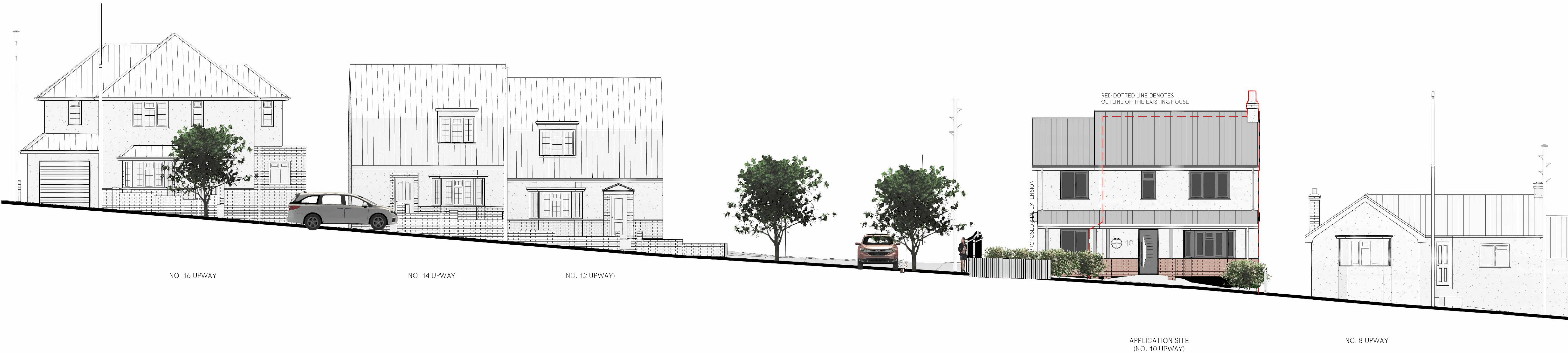
PROPOSED STREET SCENE ALONG UPWAY

REV. DATE. AMENDMENT. 0 1 2 3 4 5m SCALE 1:100