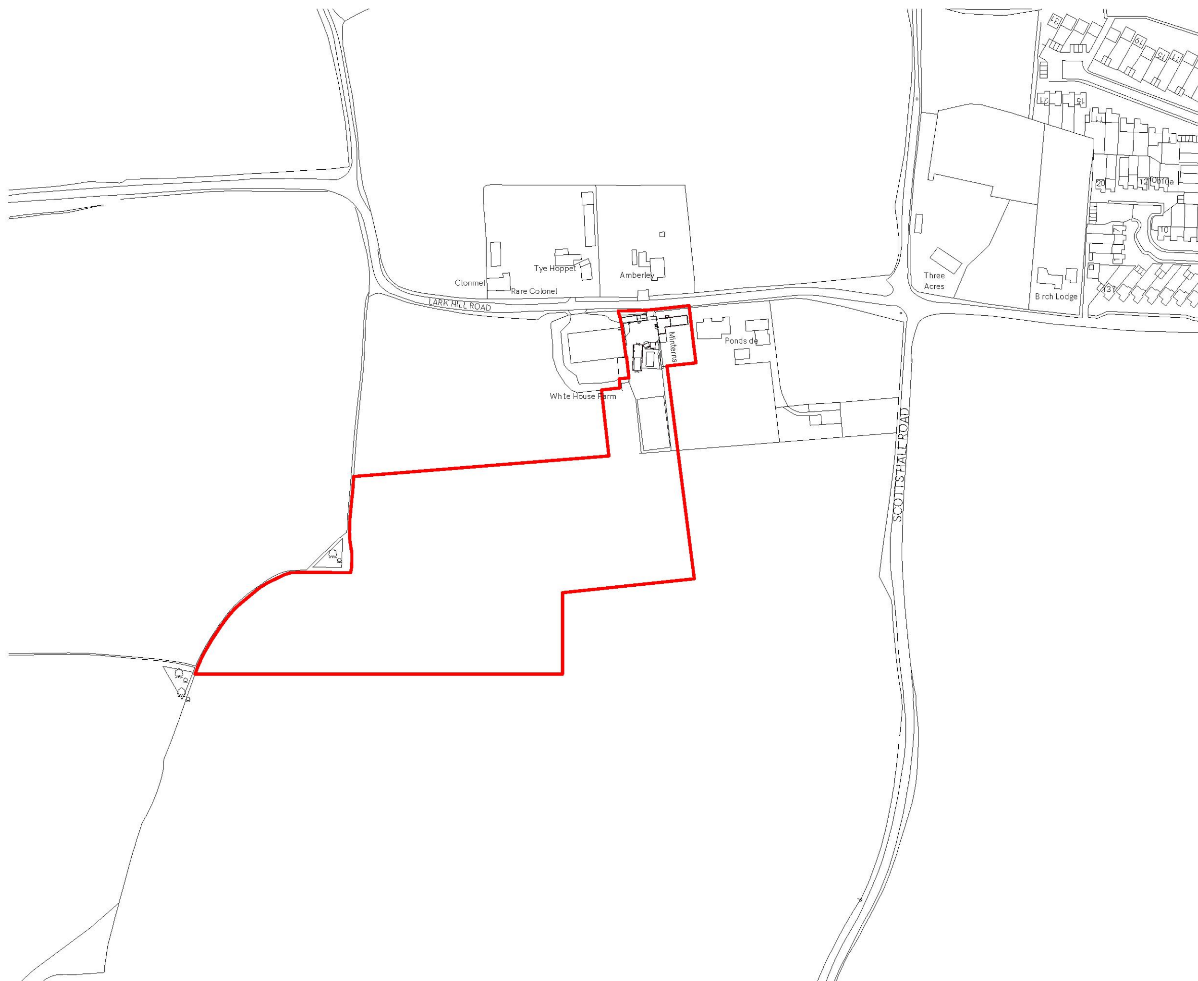
1 Location Plan 1 : 2500

Project No: 22-139A Drawing No: TPA-0-001 Rev: