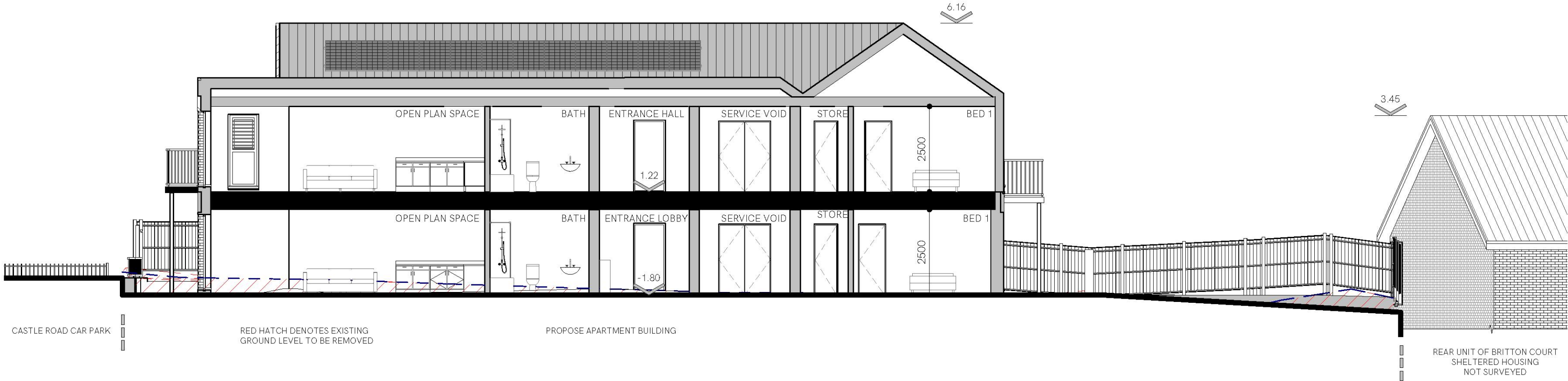
PROPOSED SECTION A-A 1 : 100

The copyright in all drawings, schedules, specifications and any other documentation prepared by BGA Architects in relation to this project shall remain the property of BGA Architects and must not be re-issued, loaned or copied without prior written consent. Contractors are to check dimensions of all issued drawings and to notify the Architect immediately of any discrepancy. Do not scale from this drawing. If dimensions are not clear ask. All dimensions noted are in millimetres unless stated otherwise. The client and contractor must ensure they are working to the latest approved package and that all documents and drawings are cross-referenced to ensure that the latest revisions are being worked from. Do not build from any drawing packages that do not say, Building Control Approval, Conditional BRE Approval or For Construction.