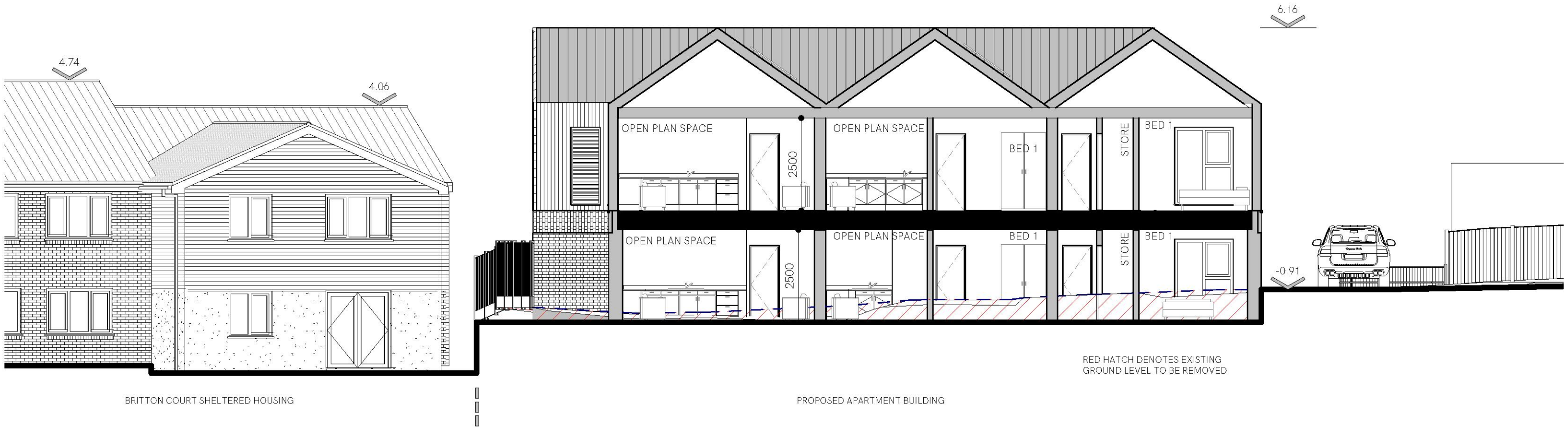
PROPOSED SECTION B-B 1 : 100