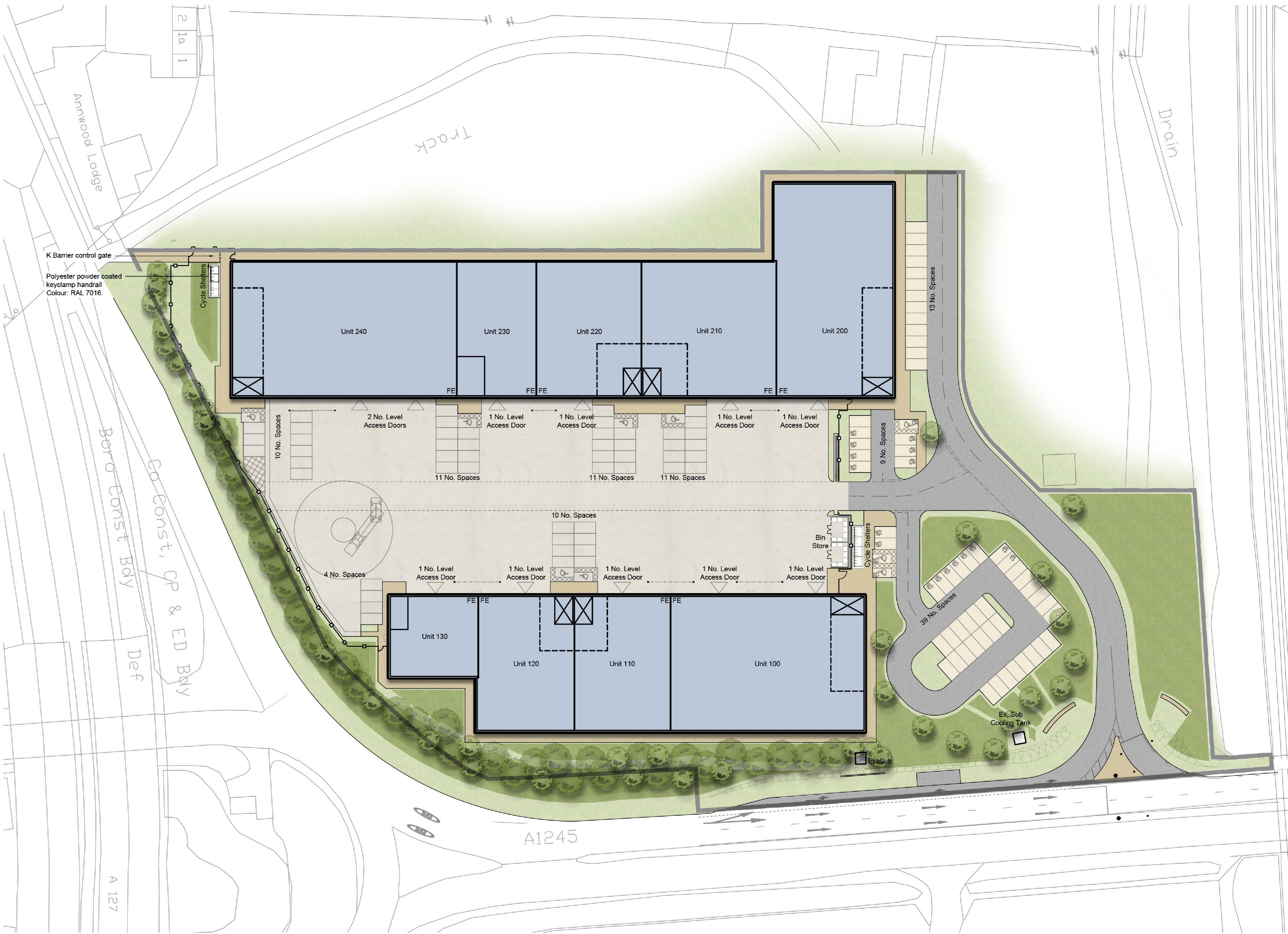
Site Layout - Scale 1:500

Proposed 2.4m high paladin security fence