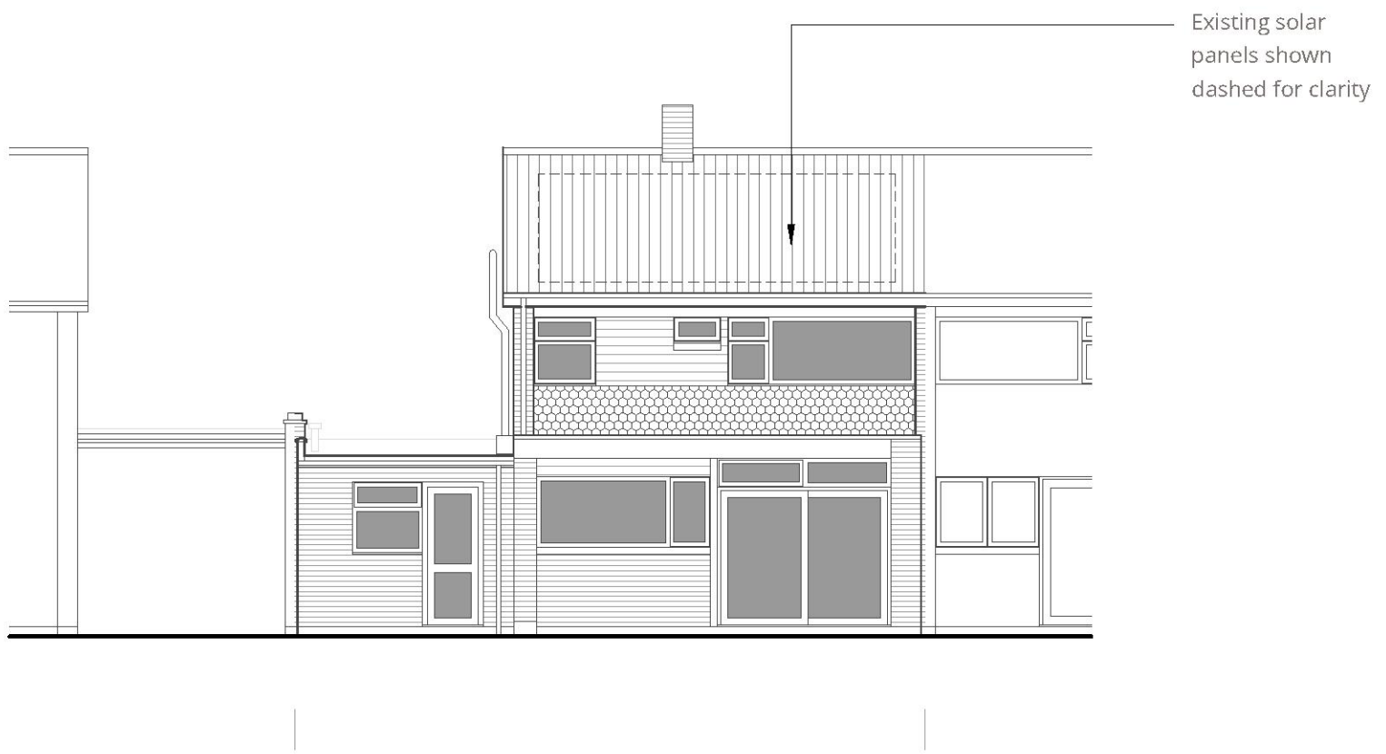
EXISTING REAR (SOUTH) ELEVATION 1:100@A3