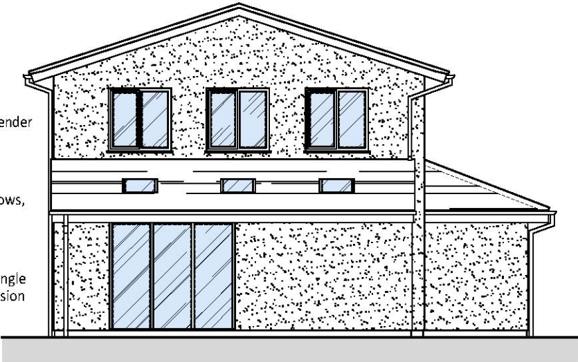
PROPERTY REAR ELEVATION SCALE 1:100