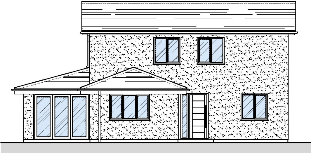
PROPERTY GREENSWOOD LANE ELEVATION SCALE 1:100