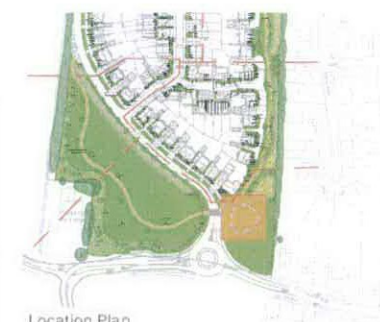
Location Plan Not to Scale