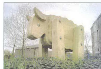
3. Sheep Play Sculpture by Hand Made Places