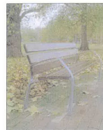
'Neo Seat' by Furnitubes