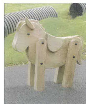
4. Horse Play Sculpture by Hand Made Places

All equipment specified from Hand Made Places. Hand Made Places: Phone: 01420474111 Email: info@handmadeplaces.co.uk Web: www.handmadeplaces.co.uk