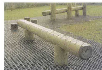
1. Balance Beam by Hand Made Places