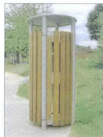
'Portman Litter Bin' by Furnitubes

COPYRIGHT © Liz Lake Associates Information contained in this drawing is confidential and may not be used for any purpose other than that for which the drawing is prepared without prior written authority of Liz Lake Associates. This drawing is copyright and may not be reproduced without the prior written consent of Liz Lake Associates. LAND MAPPING Representative from Ordnance Survey for any third party Copyright 2014, Licence No. 100071240 © Crown Copyright and database right 2014 Ordnance Survey Licensed to the LIZLAKE LTD. This drawing may contain information and/or imagery from a number of sources and its accuracy should be verified as appropriate. LIZ LAKE ASSOCIATES LANDSCAPE ARCHITECTS