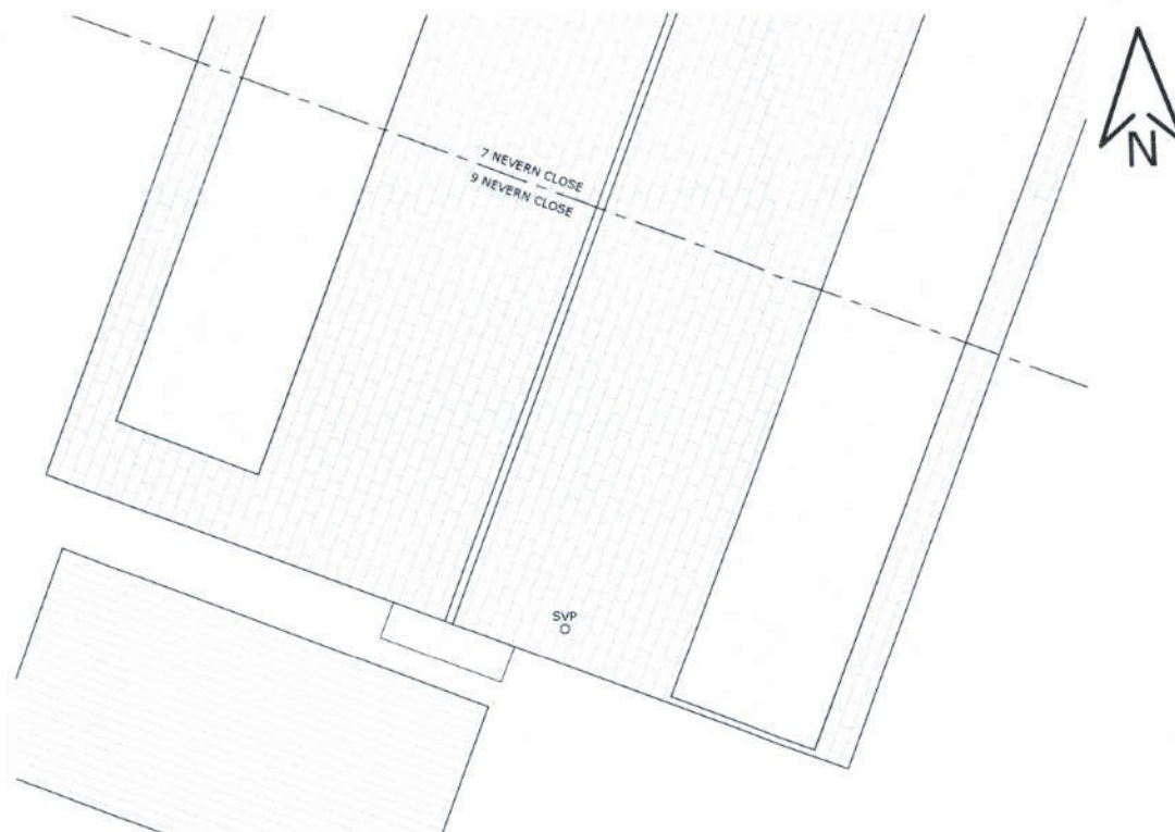
ROOF PLAN SCALE 1:100

CH = Window cill height WH = Window opening height FFL = Finished floor level SFL = Structural floor level (xxxx) = Distance from floor to U/S of ceiling/opening x 0.000 = Spot height