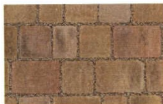
Autumn Gold (AG)