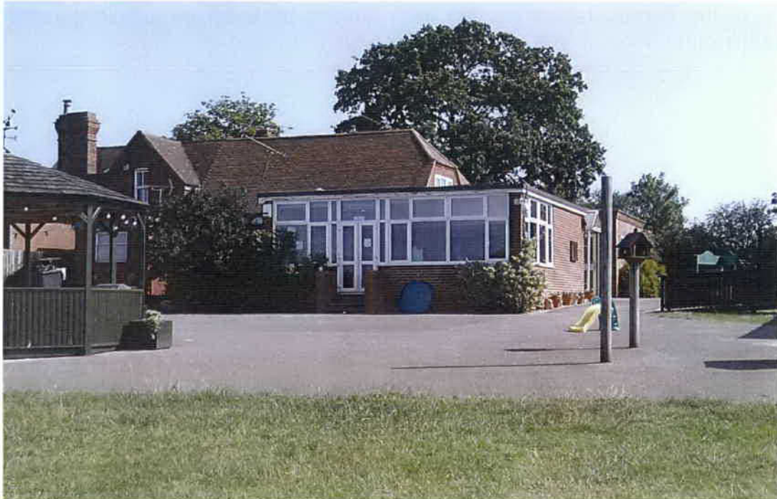
Existing photo taken from rear of school with the classroom affected in the foreground with large glazed area and white window frames. The proposed Pergola will be in front of this elevation.

The site was originally St. Nicholas School with the main school building being divided into a nursery and separate dwelling. The major part of playgrounds were retained for the nursery.