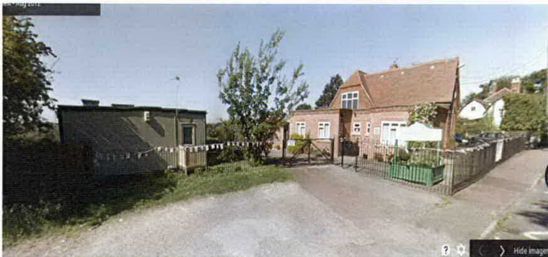
Existing Site frontage from Church Road with Demountables to the left painted green and main nursery building in brick to the left