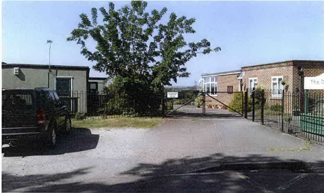
Existing Entrance to Site from Church Road

The site is well kept and landscaped with large playground areas of tarmac and grass.