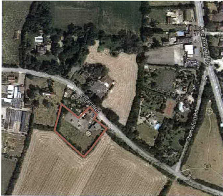
Arial Google Location Image