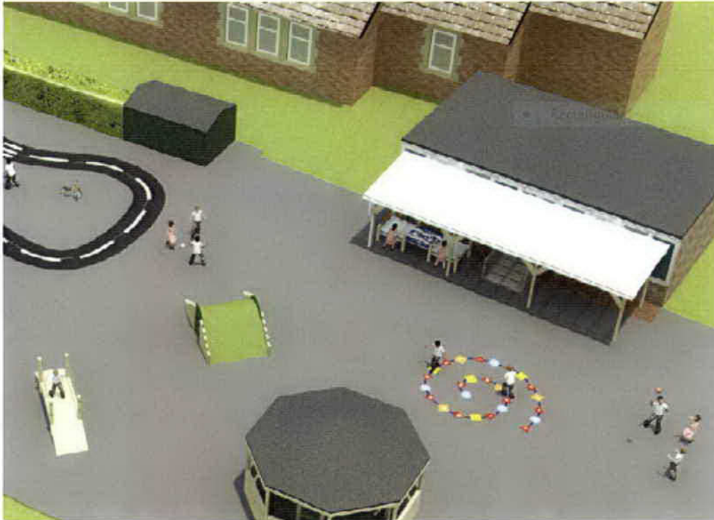
Proposed pergola shown to rear of classroom with a white roof for highlighting purposes.