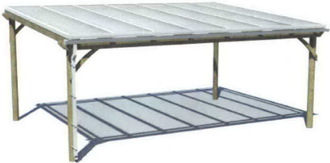
3D view of pergola