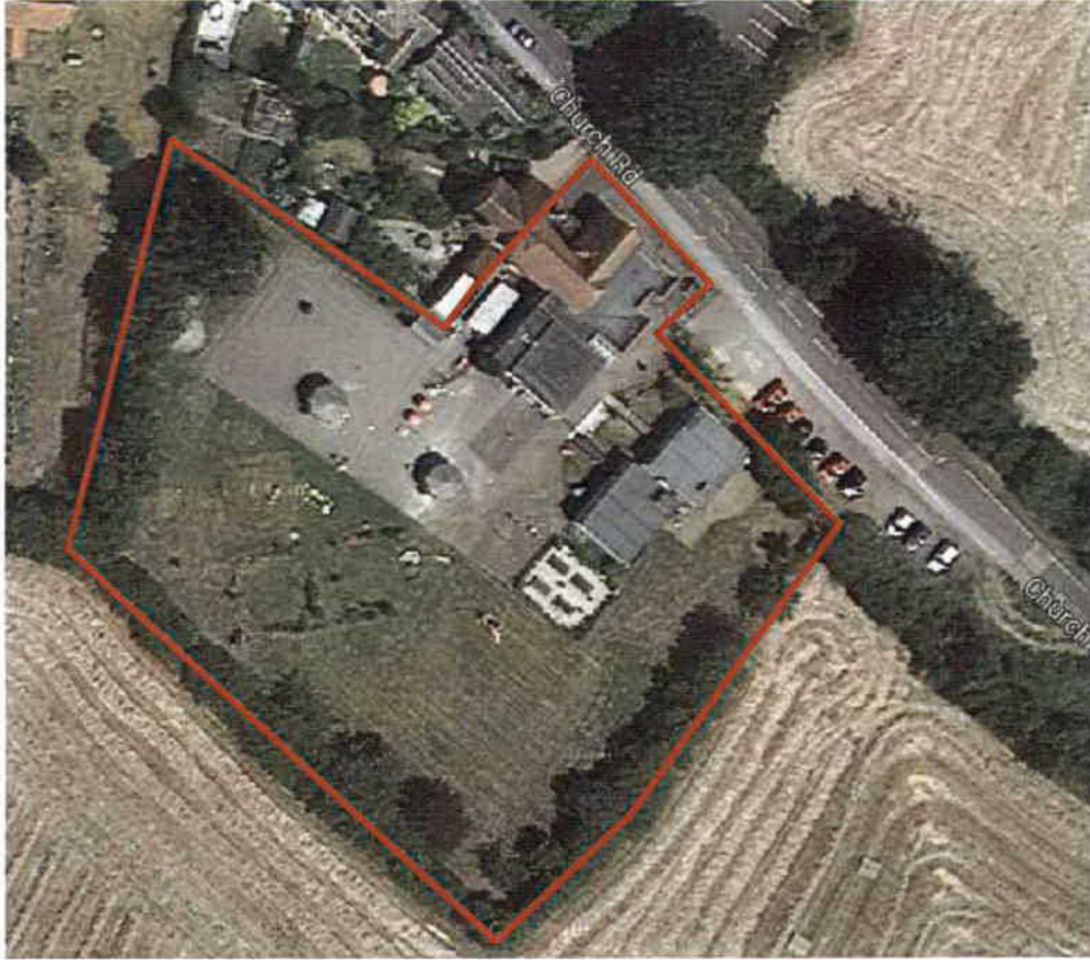
Arial Google Site Image