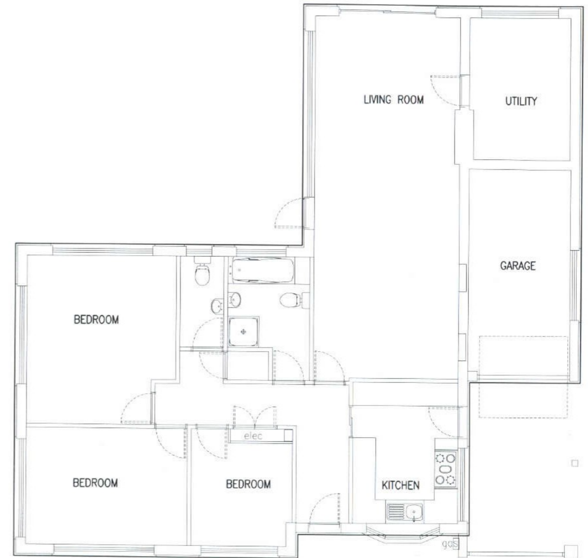
GROUND FLOOR PLAN FOOTPRINT 145m2 GROSS