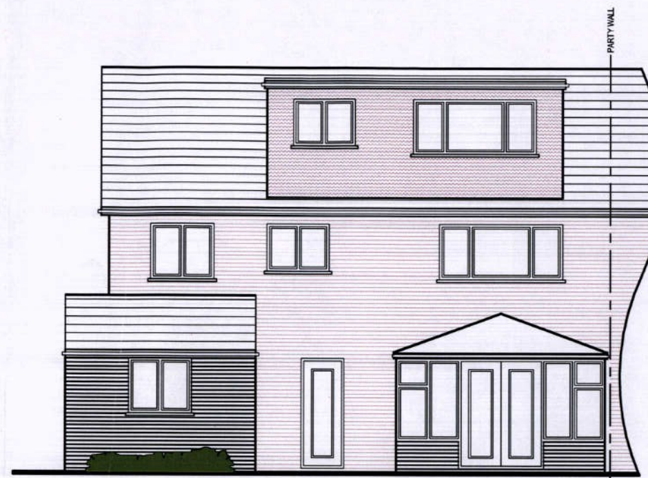
PROPOSED REAR FACING EAST ELEVATION