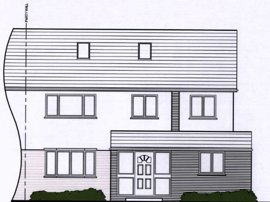
PROPOSED FRONT FACING WEST ELEVATION

14/00747/K This drawing is copyright 2014 © and must not be reproduced in whole or part without obtaining written authority from KMDS GROUP. This drawing is to be read in conjunction with all other relevant Architects, Structural Engineer or third party drawings. All dimensions are to be checked onsite against site conditions and any discrepancy advised to the designer before any works commence. DO NOT SCALE THIS DRAWING