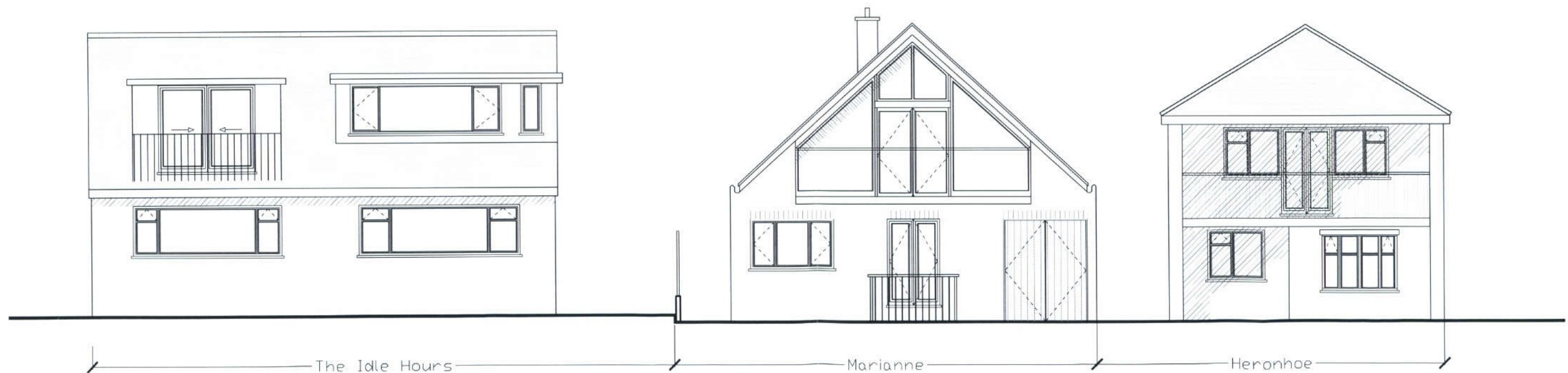
1:100 Proposed Street Scene