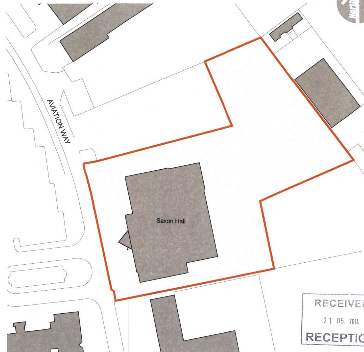
Site Plan 1:1000

Thick dashed line indicates extent of new proposed entrance canopy over.