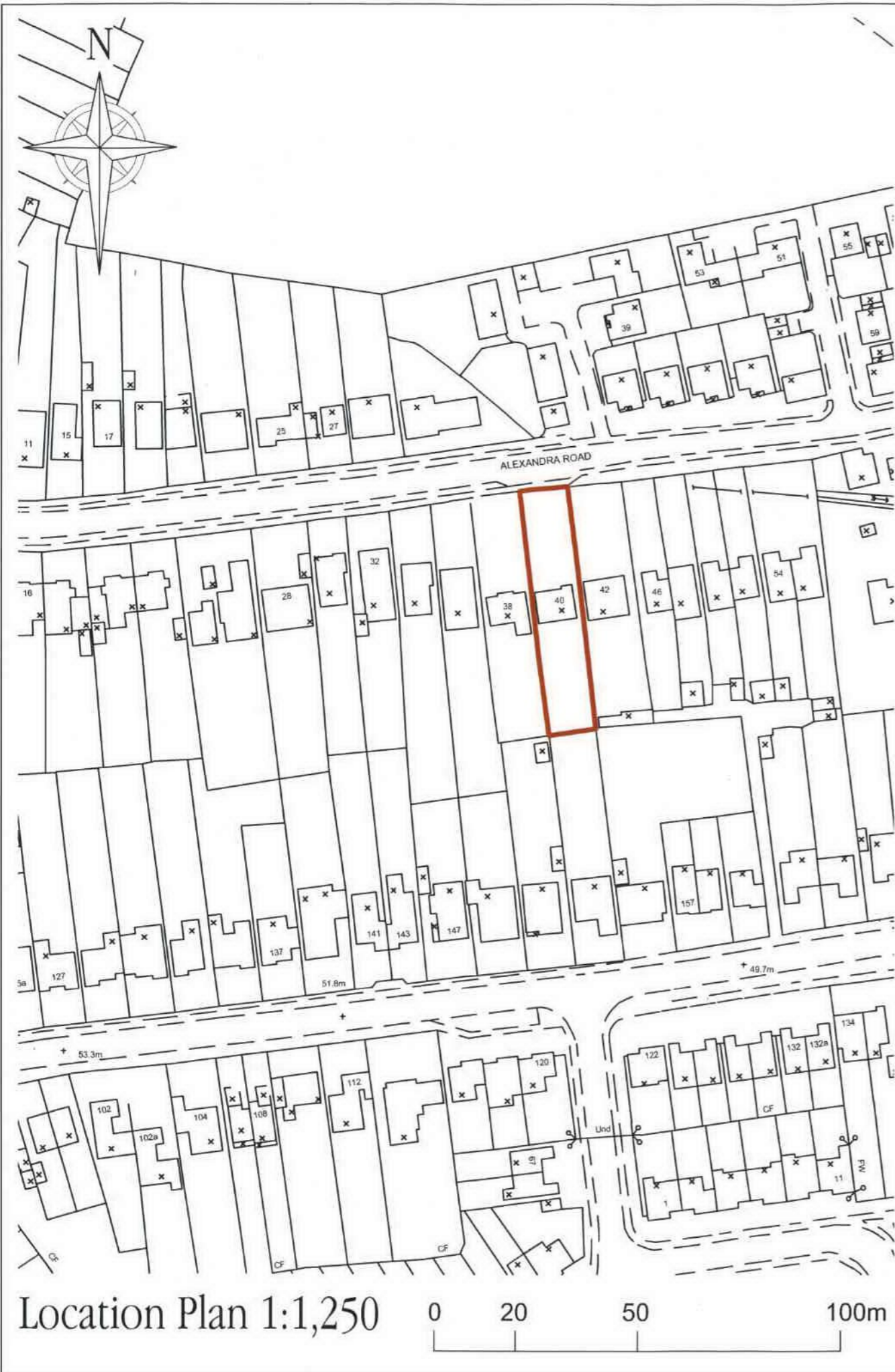
40 Alexandra Road, Rayleigh