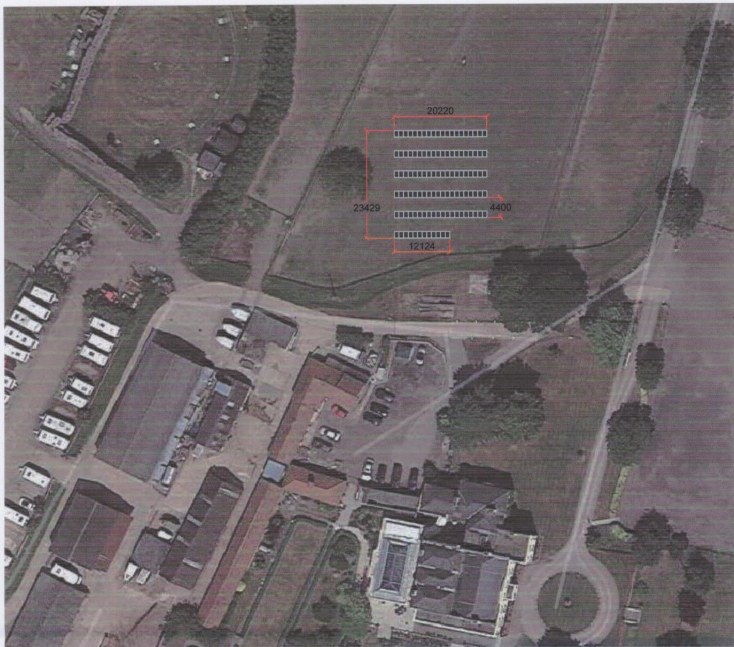
GOOGLE EARTH ARIAL VIEW