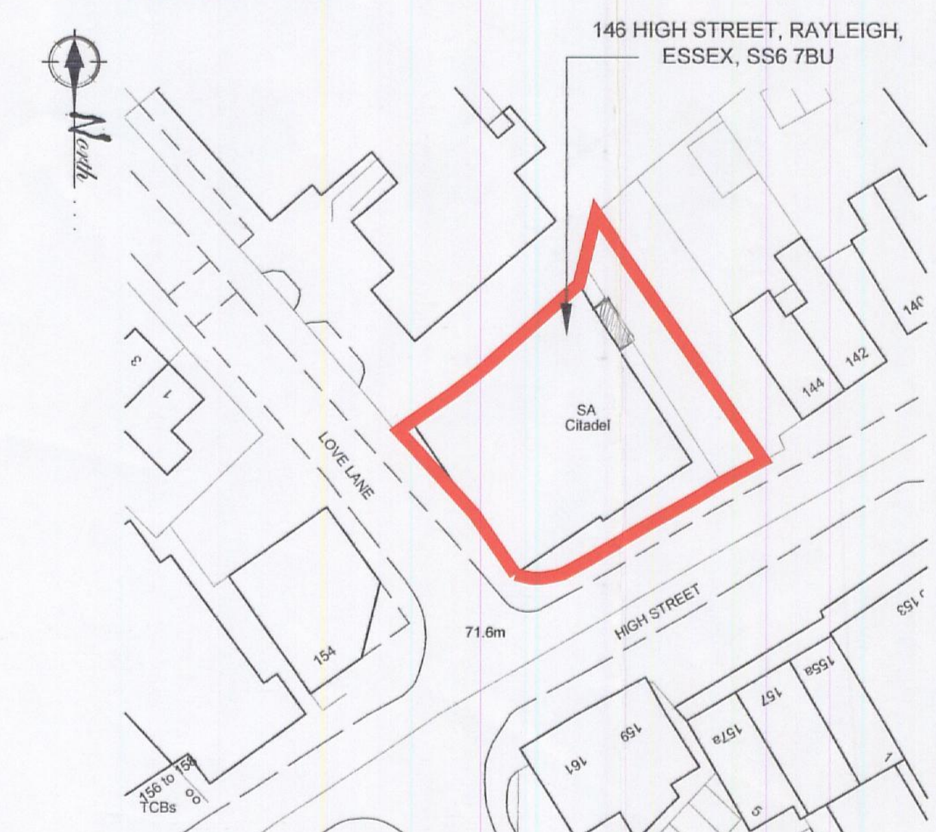
SITE BLOCK PLAN SCALE 1:500